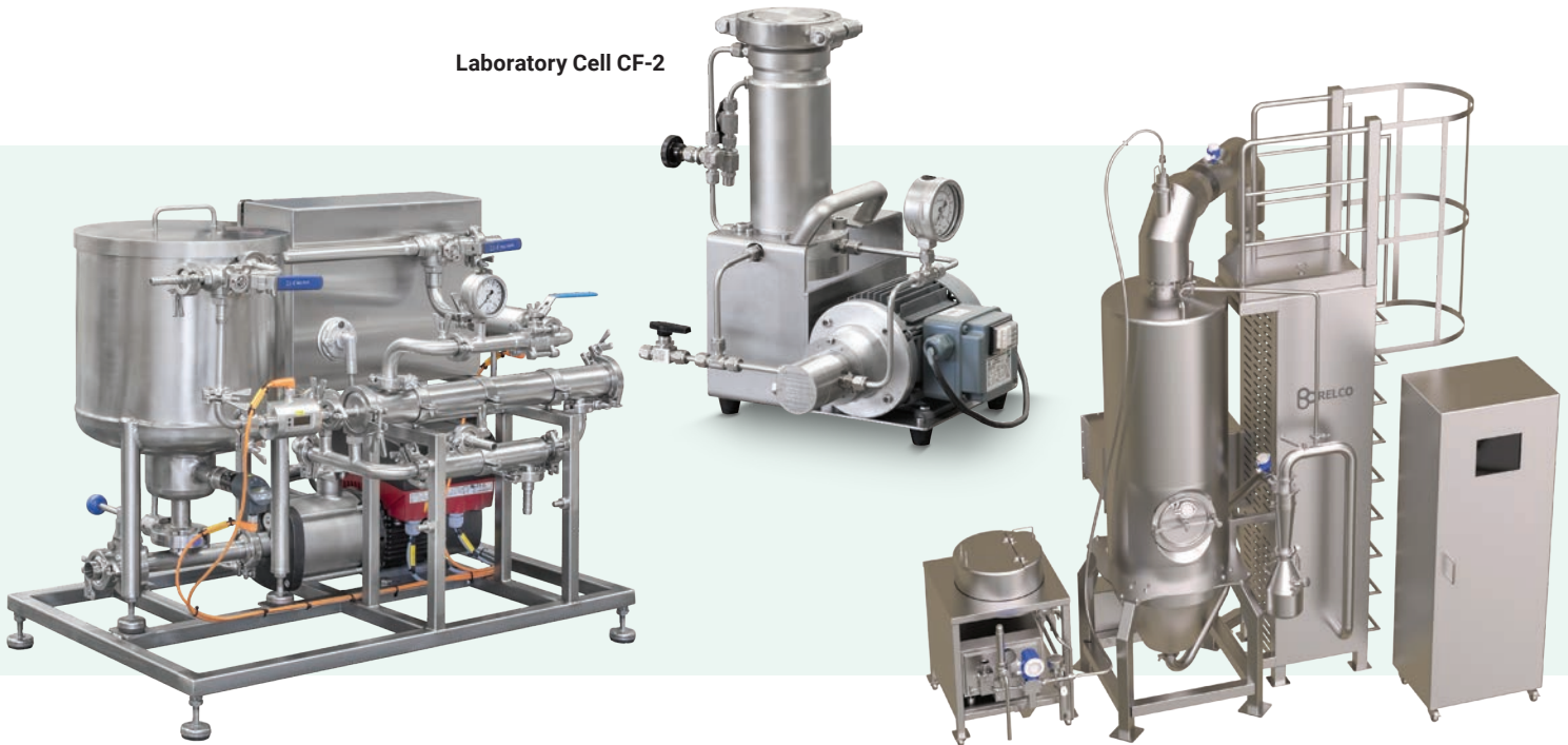
Multi-Purpose Test Unit