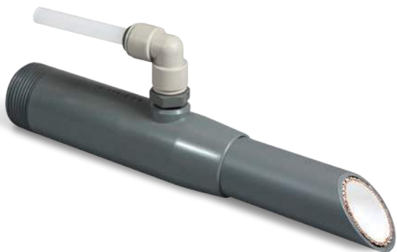
FEG PLUS 1-inch Tubular Membranes

The KONSOLIDATOR system features FEG PLUS® tubular membranes in an open-channel configuration with maximum feed TSS concentrations up to 500,000 mg/L. These durable membranes can withstand harsh chemical environments, making it an ideal solution to treat wastewater streams for applications such as metal working, pulp and paper, or oil and gas. For high-fouling applications, spongeballs are used to enhance cleaning of the FEG PLUS tubes by scrubbing away solids that have accumulated on the membrane surface, eliminating clogs and minimizing downtime due to frequent cleaning cycles, sludging, and repair.