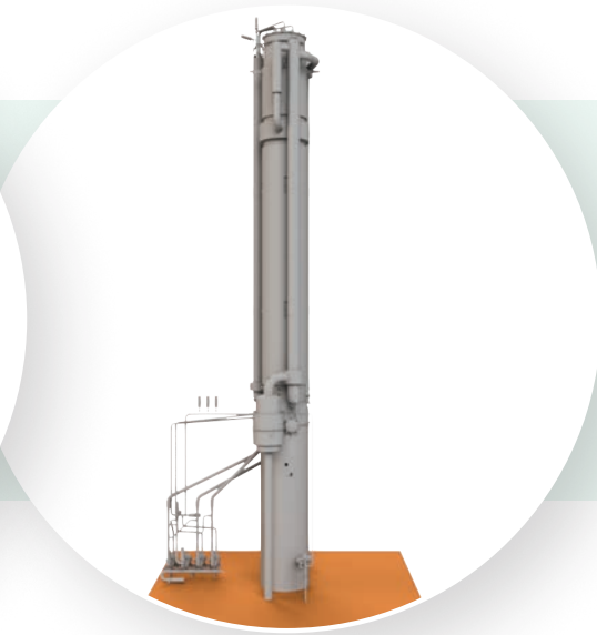
RELCO Hi-Con Evaporator