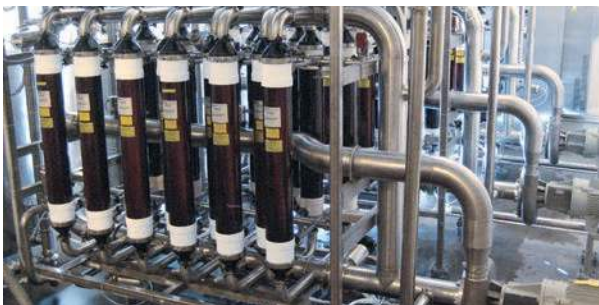
Woodbridge 3-stage Continuous WINEFILTER System

Woodbridge Winery needed an economical alternative to conventional wine filtration methods without sacrificing wine quality. Using conventional methods, wine has to be filtered in multiple steps. The excessive filtration often strips the red wines of flavor and color. Conventional methods also involve high labor, material, storage and disposal costs when compared to CMF technology.