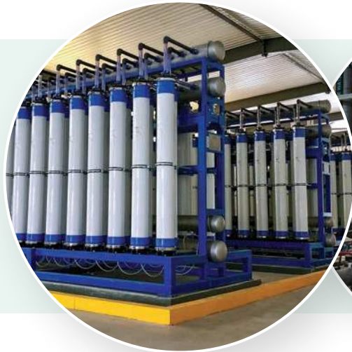
PURON MP System