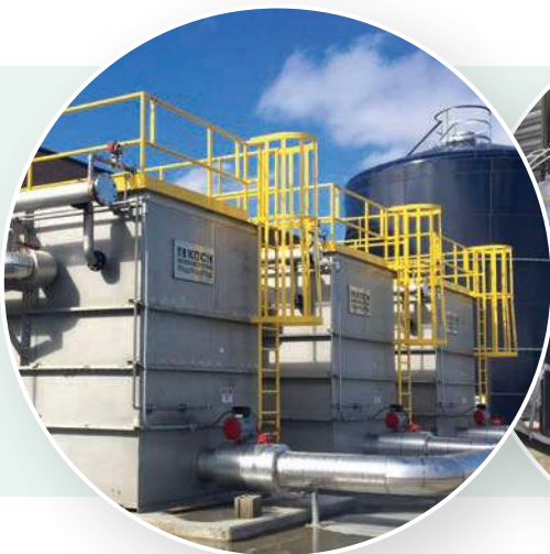
PURON MBR System