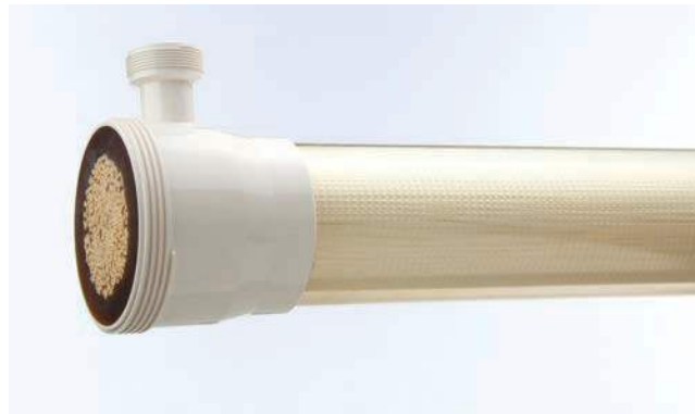
ROMICON Hollow Fiber Cartridge

ROMICON® hollow fiber membranes operate with process flow from the inside out during filtration. The process fluid flows through the center of the hollow fiber and the permeate passes through the fiber wall to the outside of the membrane fiber. The tangential flow of the process fluid continually acts to limit membrane fouling. In addition, the construction of the hollow fiber permits backflushing with permeate and the reversal of retentate flow. These operating modes are highly effective in maintaining flux rates. KSS developed a special low pH cleaning procedure that enhances protein recovery and avoids damaging the molecular structure of the Proteus product. ROMICON polysulfone membranes meet FDA sanitary requirements for food contact.”