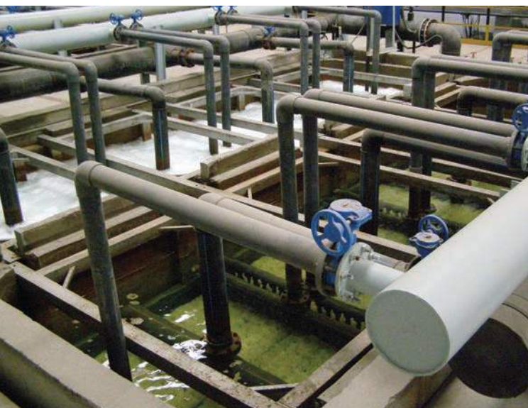
Baotou Steel Tertiary Treatment Plant, Inner Mongolia, China