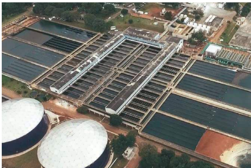
Alto da Boa Vista Drinking Water Treatment Plant, São Paulo, Brazil