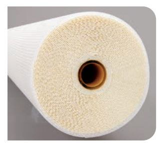
BAND-TITE Element as removed from housing