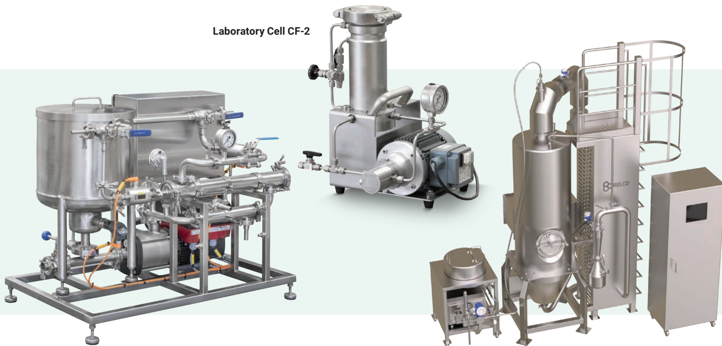
Multi-Purpose Test Unit